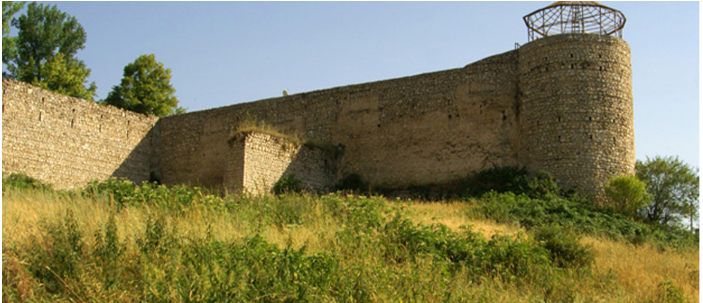
Artsakh – Shushi Fortress