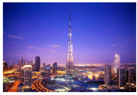
in the UAE.

As of February 1, Armenian citizens can enter, exit and transit through the UAE without an entry visa or fee. The passport of an Armenian national must be valid for at least 6 months from their arrival date