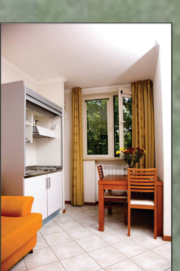
Modern Rest Rooms

Warm Welcome 24/7 Security Free Cafe & Bar