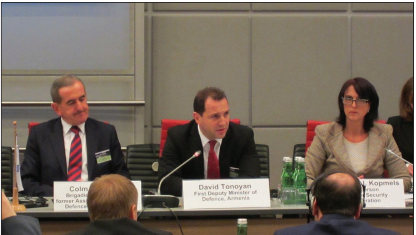
From February 16 th to 17 th , the delegation headed by RA First Deputy Minister of Defence Davit Tonoyan took part in the "Military Doctrine Seminar" in Vienna.