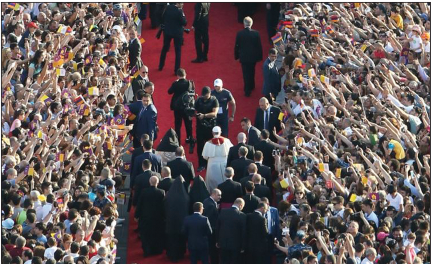
Armenia - Armenians greet Pope Francis and Catholicos Garegin II in Yerevan's Republic Square, 25Jun2016.