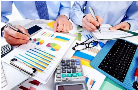
Armenia's economic activity index

increased by 8.1 percent in January–October of this year compared to the same period of the previous year, according to data published by the Statistical Committee.