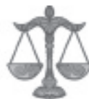
Libra (Sep. 23–Oct. 22)

You are in a high energy zone this week! You want to go everywhere and do everything at once. You feel generous to others and they to you. If money is an issue, then you would be better off to leave credit cards at home. Activities that involve physical self-expression are favored.