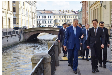
The official site of Yerevan Municipality | www.yerevan.am

distribution to the trade chains of Saint Petersburg.