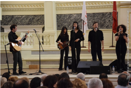
The official site of Yerevan Municipality | www.yerevan.am

Greeting the members of Yerevan delegation, acting Governor of Saint Petersburg Alexander Beglov stressed the existence of the potential for further development and expansion of the relations between the two parties.