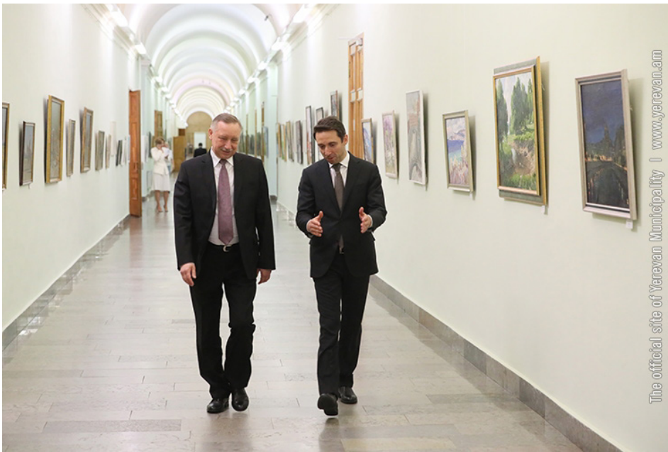
The official site of Yerevan Municipality | www.yerevan.am

The delegation headed by Yerevan Mayor Hayk Marutyán which is in the northern capital of the Russian Federation, met Saint Petersburg acting Governor Alexander Beglov, the Yerevan Municipality told Noyan Tapan.