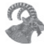
Capricorn (December 21–January 19)

The "rules" and the world's expectations have you tied up like a pretzel right now. The harder you struggle, the tighter those binds seem to become. It's like a Chinese puzzle. Sometimes if you relax on the control issues, the solution comes through. Give it some space.