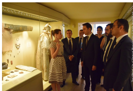
The official site of Yerevan Municipality | www.yerevan.am

Stressing the importance of the willingness of Saint Petersburg Government to expand and strengthen the partnership, Yerevan Mayor expressed confidence that the Yerevan Days in Saint Petersburg event will convey a new impulse to bilateral relation-