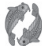
Pisces (February 18–March 19)

You could become embroiled in a battle of wills over who is right. In order to steer clear of a war, remain aware that the subject matter is merely what you think, not who you are. You have the controlling word in any battle. Use it ethically and don't blow away your opponent. Drive Carefully.